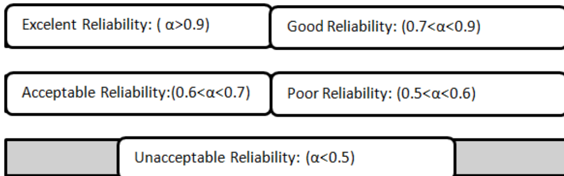
Figure 3: Reliability Criteria

SPSS was used to check the reliability of the questionnaire. The following table shows the reliability results of the current study.